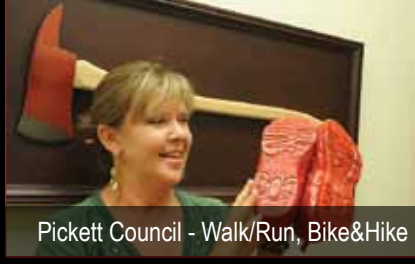
Pickett Council - Walk/Run, Bike&Hike